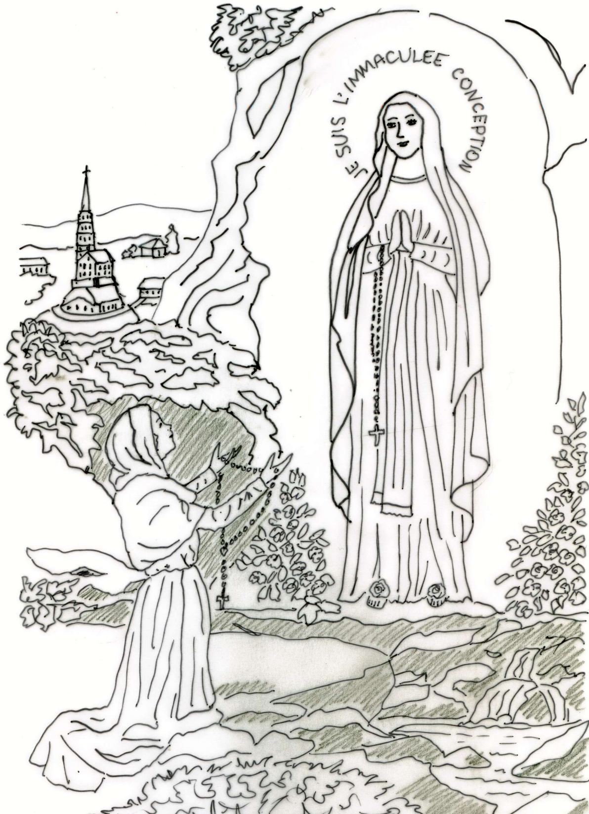
~ Our Lady of Lourdes - Feast Day, February 11 ~