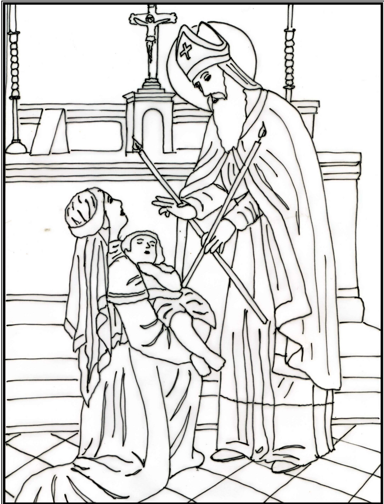
St. Blasé ~ Feast day, February 2 nd ~ Patron Saint of Illnesses of the Throat