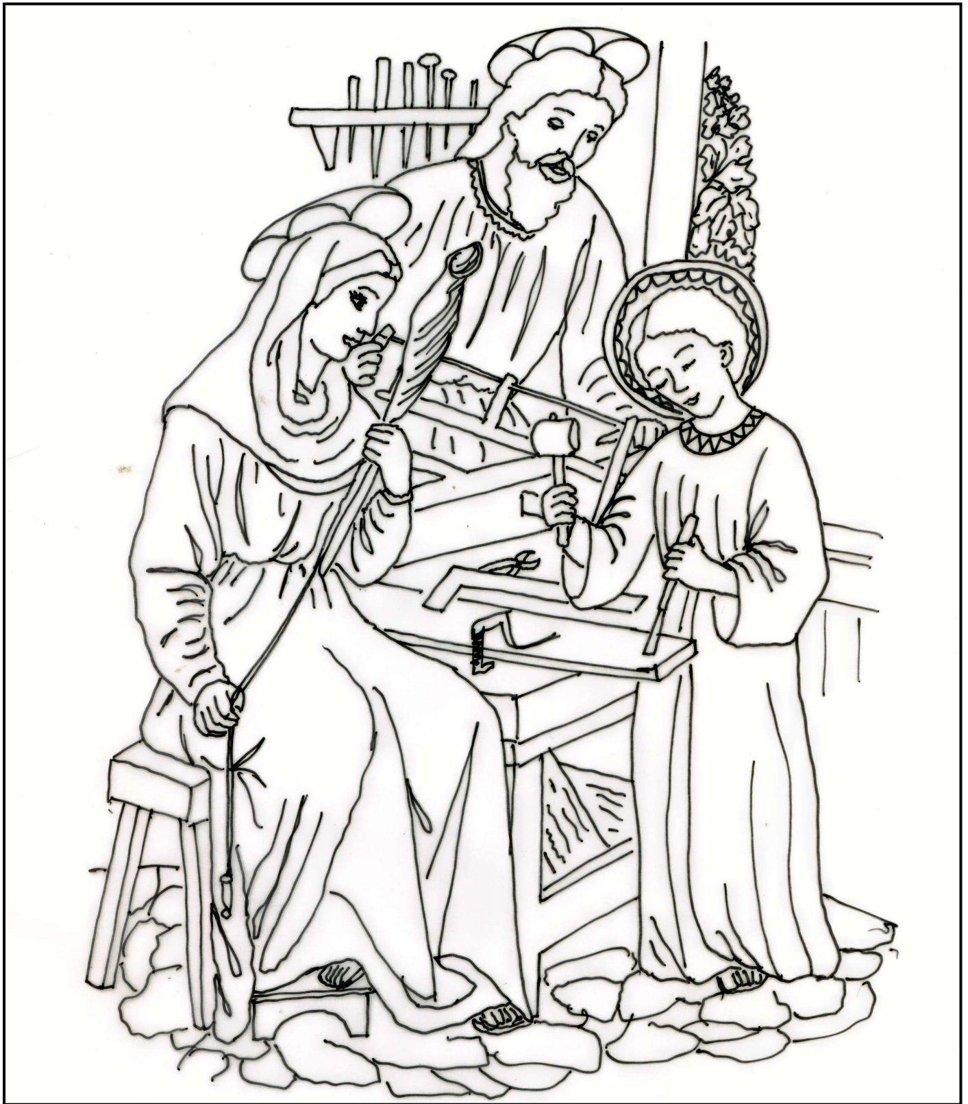
The Holy Family ~ Feast day, February 15 th