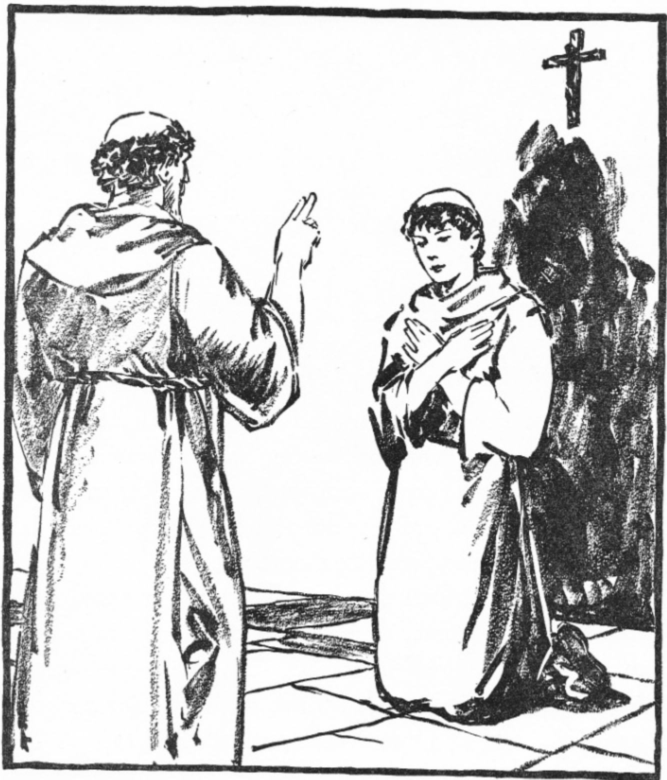
The Abbot welcomed him