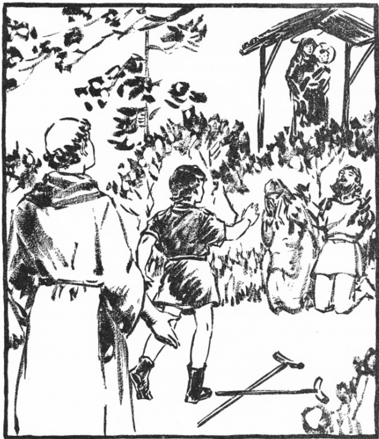
Miracles took place in Fiacre's garden