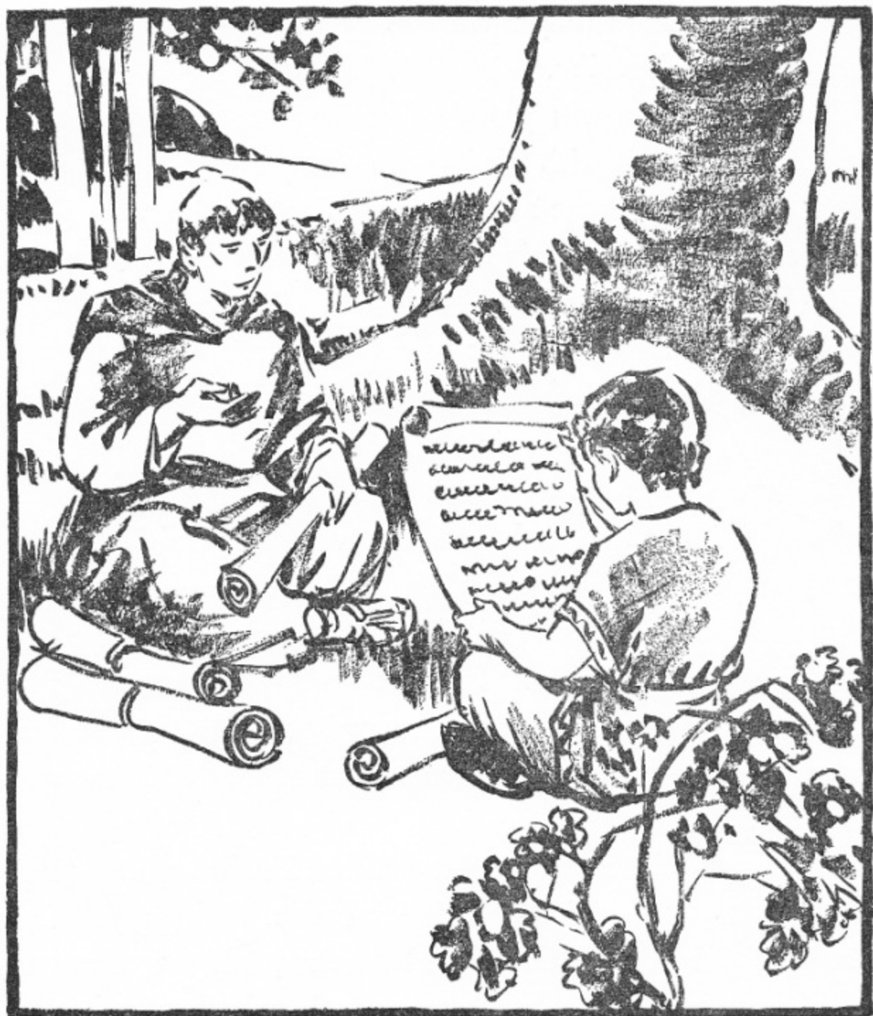
People were taught by monks