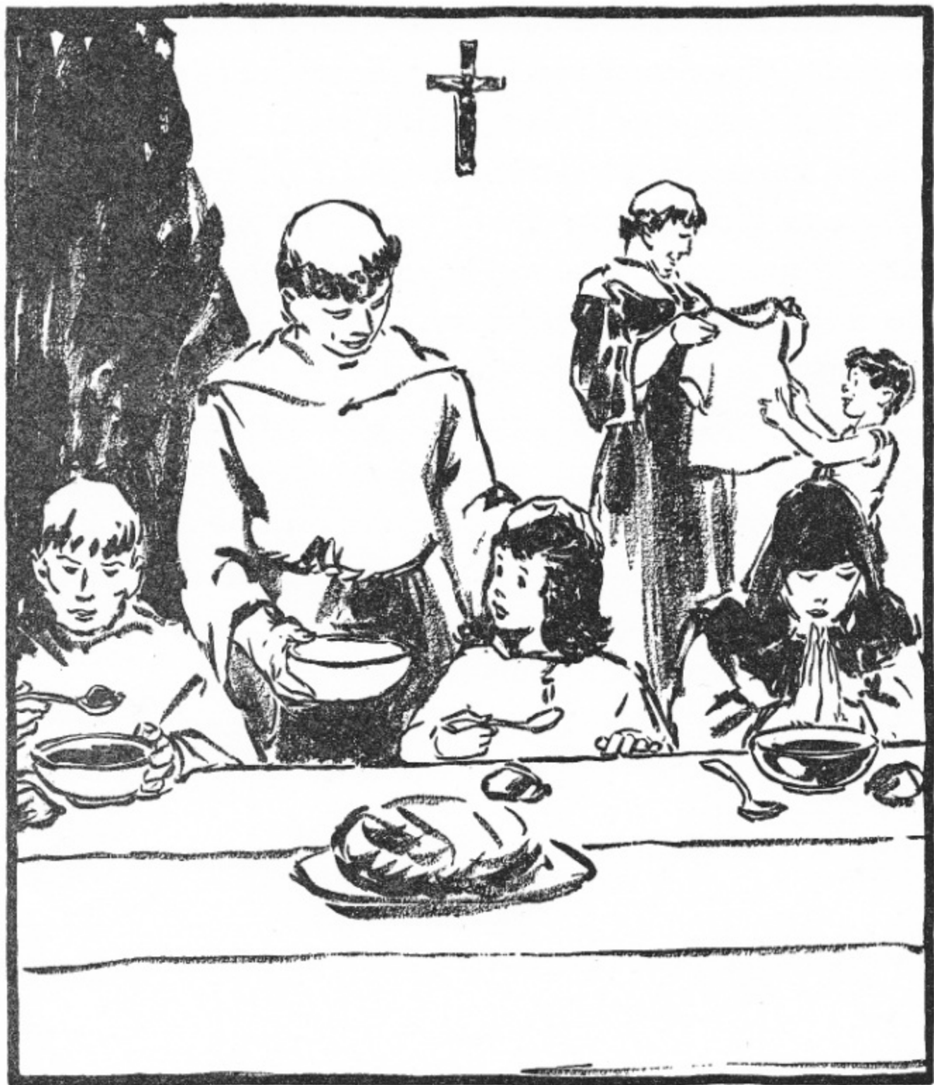
They fed and clothed the poor