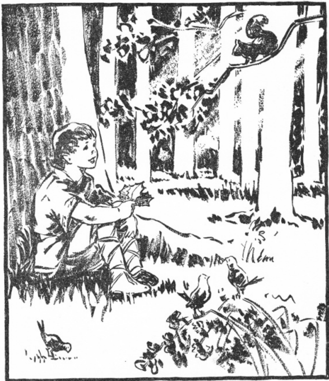
Fiachra loved each Season