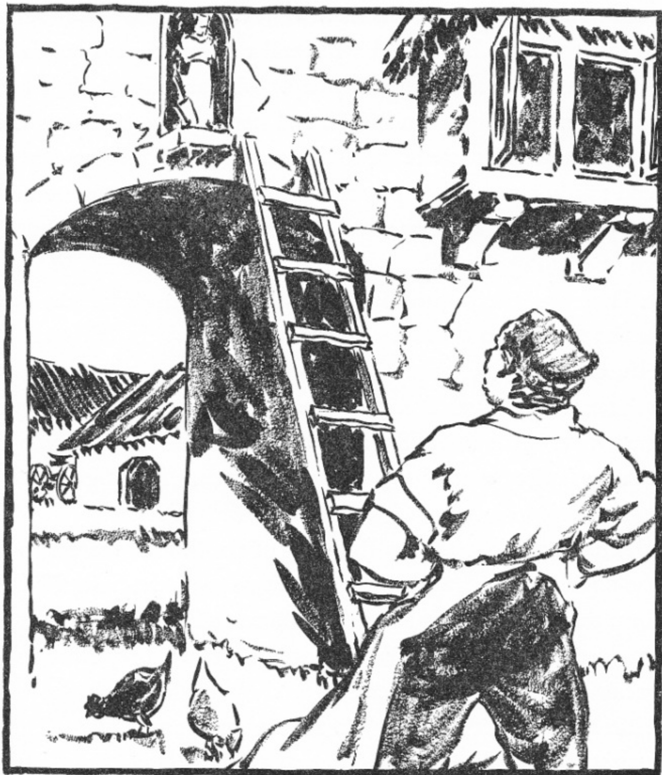
Above the door a statue of St. Fiacre