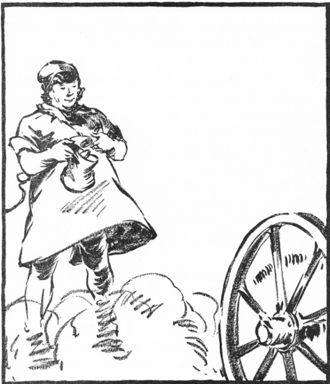
They hired carriages at the St. Fiacre