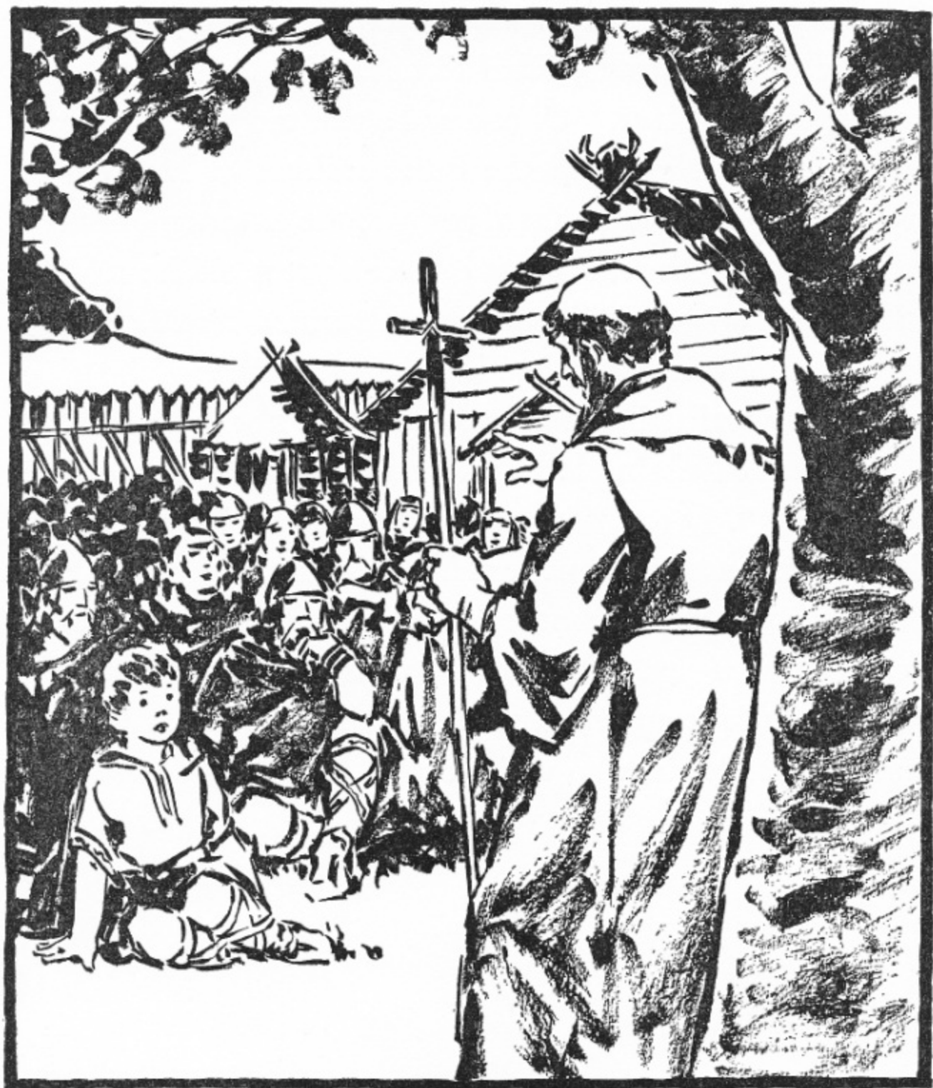
Fiachra sat as near as he could