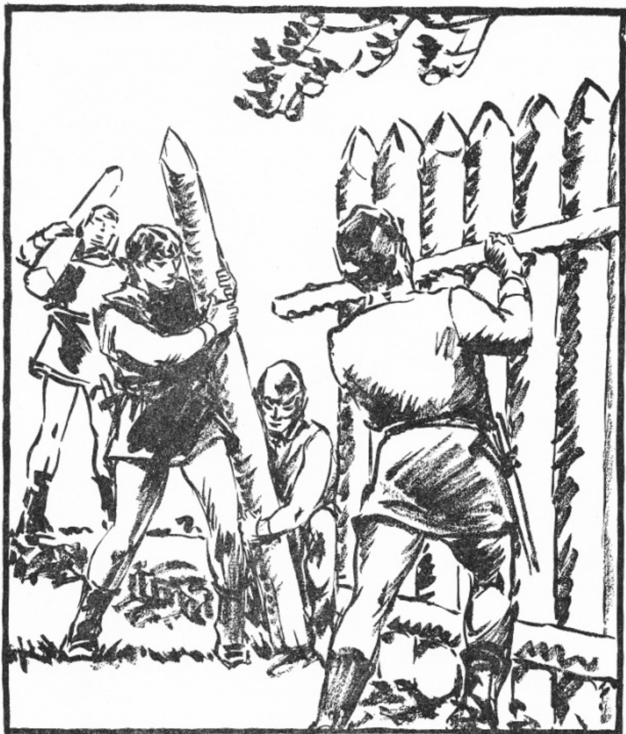
They cut down trees and built fences