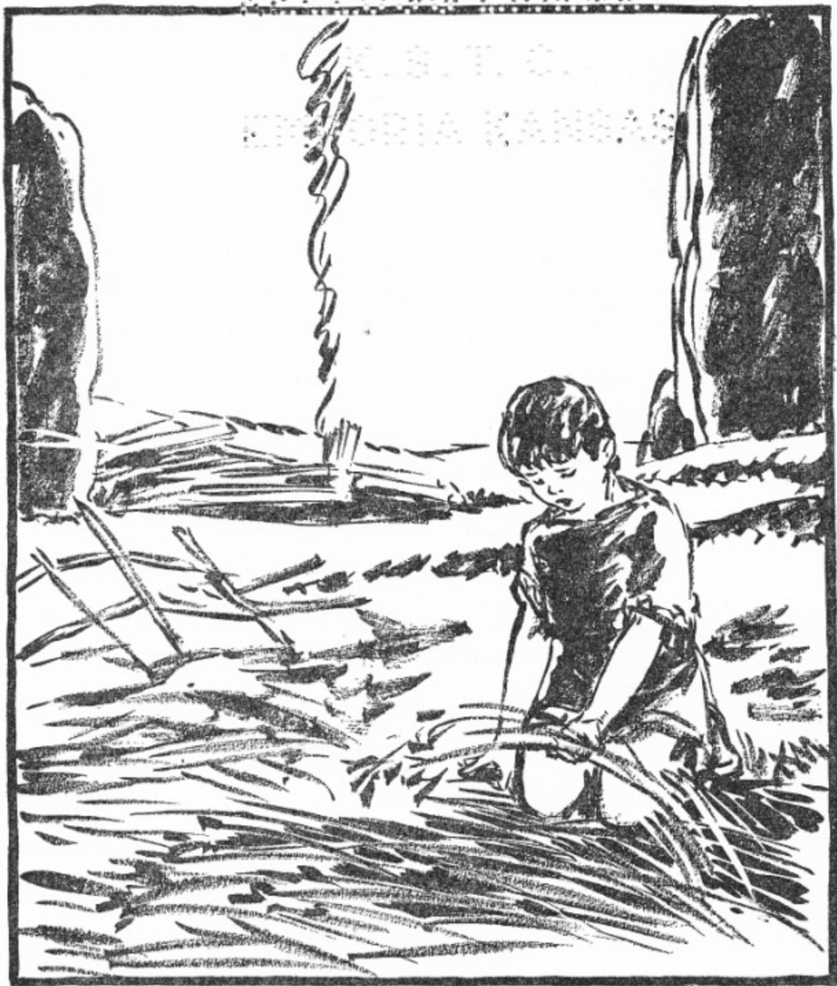
Fiachra's garden had been destroyed