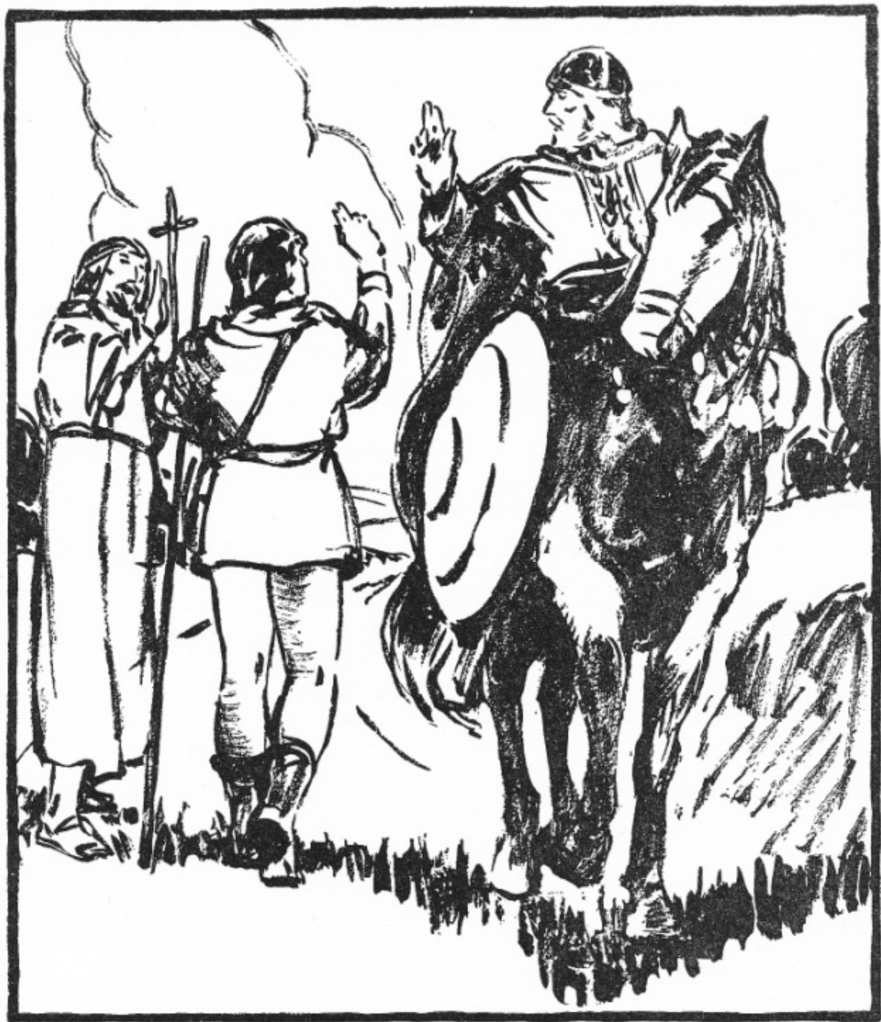
Travel was on foot and on horseback